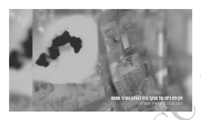
Figure 2: Image captured from the video shared by the Israeli Air Force showing the destruction of the top floors of the apartment building

The home of a battalion commander in the Hamas terrorist organization, we apons production sites, and military compounds: The Air Force attacked over 130 terrorist targets and reinforcements of the terrorist organizations Hamas and Palestinian Islamic Jihad in the Gaza Strip last night. For more details bit.ly/3y4mS \rm U8