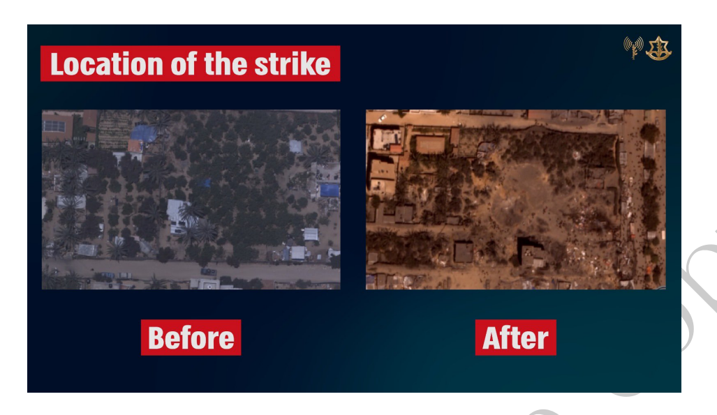
Figure 5: Aerial images of the residential compound targeted on July 13, 2024 taken before and and after the attack shared by the Israeli army on social media platforms

army at any point since the attack ^{221} such that an arrest warrant against Deif was issued by the International Criminal Court on November 21st 2024. ^{222}