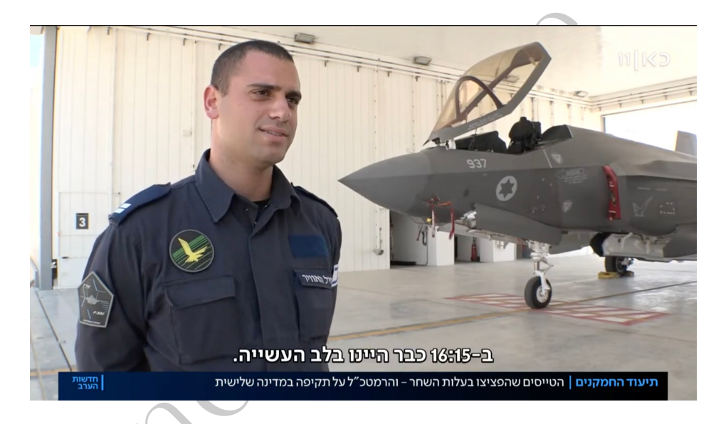
Figure 4: Image captured from a recording of a Channel 11 news report showing a pilot of the Golden Squadron at the Nevatim Air Base standing in front of an F-35 fighter jet

"The squadron commander contacted us, we understood exactly what was needed from us and started working. At 4:15 p.m. we were already in the heart of the action." ^{165}